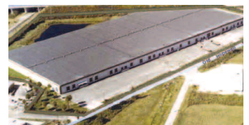
225,000 sf Multi-Tenant Warehouse Tampa, FL