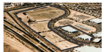
Phoenix Tech Center Phoenix, AZ