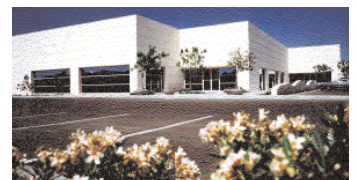
The CAD Center Phoenix, AZ