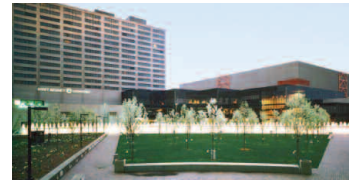
Lexington Center Lexington, KY

Stearns Business Park, Tucson, AZ 52,559 sf Office Complex plus 6.56 acres Broadway at 41st, Phoenix, AZ 47,040 sf Office/Flex Building Park at Palmdale, Tucson, AZ 35,000 sf Office Building Phoenix Tech Center, Phoenix, AZ Two Office/Flex/R&D Buildings totaling 62,000 sf Riverview Business Center, Phoenix, AZ 83,000 sf Multi-Tenant/Flex Buildings, plus 15 acres Stearns Commerce Center, Tucson, AZ Two Retail and Three Industrial Buildings comprising 84,468 sf Commercial/Arques, Sunnyvale, CA Two Corporate Headquarters/R&D Buildings totaling 82,000 sf Weddell Drive, Sunnyvale, CA 63,000 sf Research and Development Building Stearns Research Center, San Jose, CA Four R&D Buildings totaling 163,752 sf, plus 12.83 acres Stearns Oakmead, Sunnyvale, CA 44,000 sf Research and Development Building Mercury Drive, Sunnyvale, CA 25,000 sf Research and Development Building Mikohn Gaming Corporation, Hurricane, UT 86,000 sf Manufacturing/Office/Warehouse Building