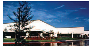
Weddell Drive Sunnyvale, CA