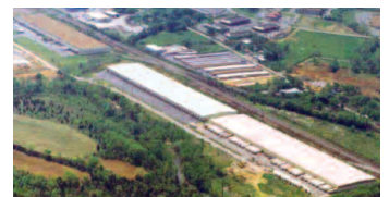
592,000 sf Multi-Tenant Warehouse Nashville, TN