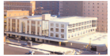
Franklin Center Johnstown, PA