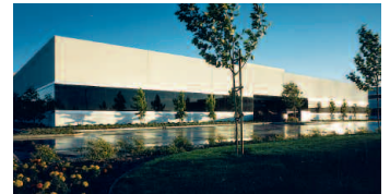
Stearns Research Center San Jose, CA