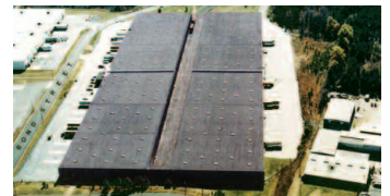
404,351 sf Distribution Warehouses Charlotte, NC