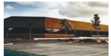
MIPS Computer Headquarters Sunnyvale, CA