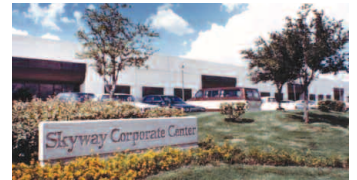
Skyway Corporate Center Irving, TX