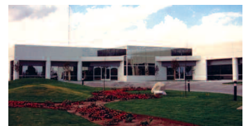
Stearns Business Park Tucson, AZ