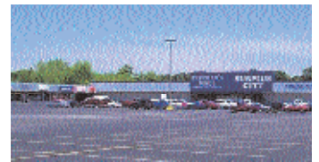
Paducah Square Shopping Center Paducah, KY

For projects listed above, Buckwalter Commercial, LLC's personnel generally served as President, COO and/or Managing Partner with full operational responsibility for most and usually all functions (i.e. leasing, financing, management, marketing, accounting, administration, sales, etc.) during a material portion, if not all, of the relevant ownership periods. Non-managing partnership interests were held in most of the projects listed below.